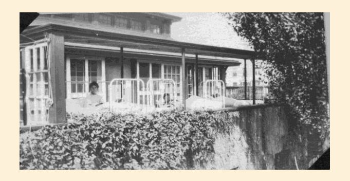
Patients on sun porch, Boston Children's Hospital, 1920.