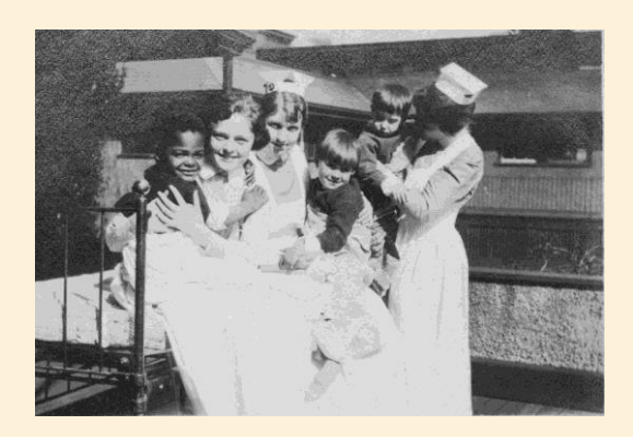
Nurses and patients on ward 5 lower sun porch, Boston Children's Hospital, 1920

Fresh air and sunshine were so widely considered essential treatment for disease in the 19th and early 20th centuries that hospital ward design, including Boston Children's, incorporated open air spaces, like these sun porches.