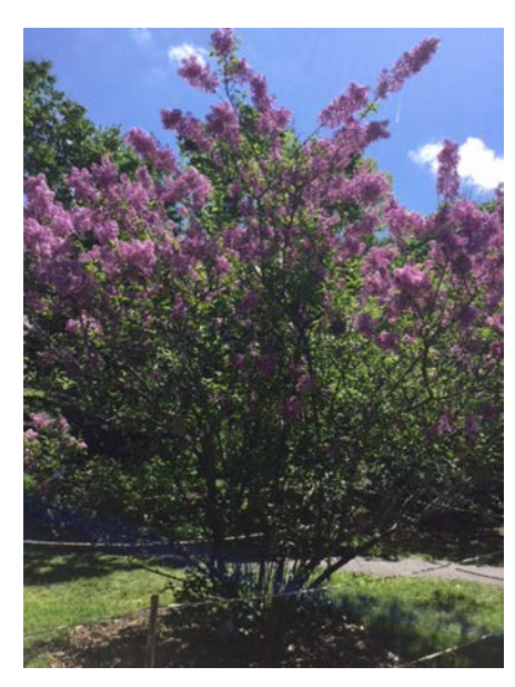
An Arnold Arboretum lilac at peak bloom

Friday, June 21: Summer Solstice Celebration Night at the Harvard Museums of Science and Culture; to mark the solstice, free admission to 4 museums, flower crowns, and astronomy lessons are offered from 5 to 9pm; see https://hmnh.harvard.edu/event/summer-solstice